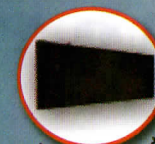
LED Display Board