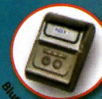
Bluetooth Thermal Printer